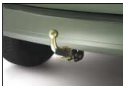
AAG602 (PHOTO 1)