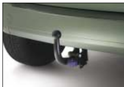
AAG604 (PHOTO 2)